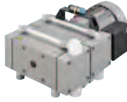
Models 2052 / 2054